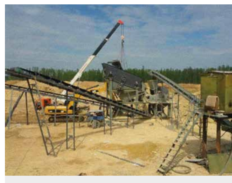
This photo from a commercial website promoting the sale of mica was taken at a mica mine in Baluchistan.<sup>238</sup>