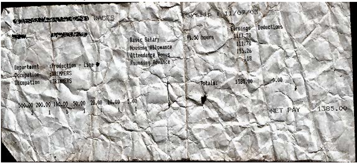
Payslip of one of the interviewed workers. (23)

According to the chairman of the Garment and Textile Manufacturers Association of Malawi, the employers who are members of this organisation should abide by a Code of Conduct that is agreed upon by all members. One of the issues that is stated is that the minimum wage should be 75 MK per day. This code does not seem to be implemented as interviews with workers certainly reveal much lower rates of pay.