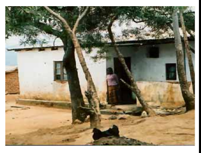
household as there is inadequate income to be spent on other basic needs as well as productive means. (5)

Most participants say they are in debt all the time as a means to survive and will have to pay this back with a 50% interest. (7)