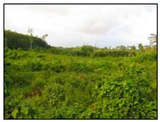
The rubber tree seedlings were barely visible in amongst the thicket of weeds as a result of a lack of maintenance by BR.

5. In several instances, BR has planted new young rubber trees, but has not maintained the farm. As a result, these trees have been completely overgrown with underbrush, which retards the growth of the seedlings and may eventually kill them. In some other areas where BR is providing maintenance, these types of activities are restricted to the fields in front of the farms. Several farms visited by the researchers carried some level of maintenance in this manner, for example the Barchue farm. In an email response, BR pointed out that it is working on the issue as the speed of maintenance activities has been set as a priority for 2011 and onwards.<sup>80</sup>