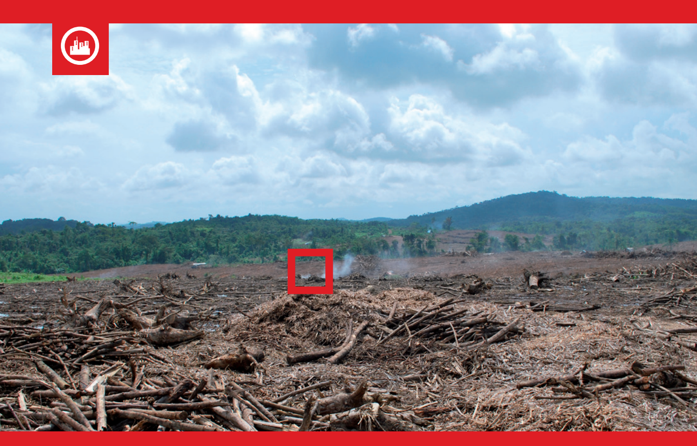
SOMO & Green Advocates

Buchanan Renewables' Impact on Sustainable Development in Liberia