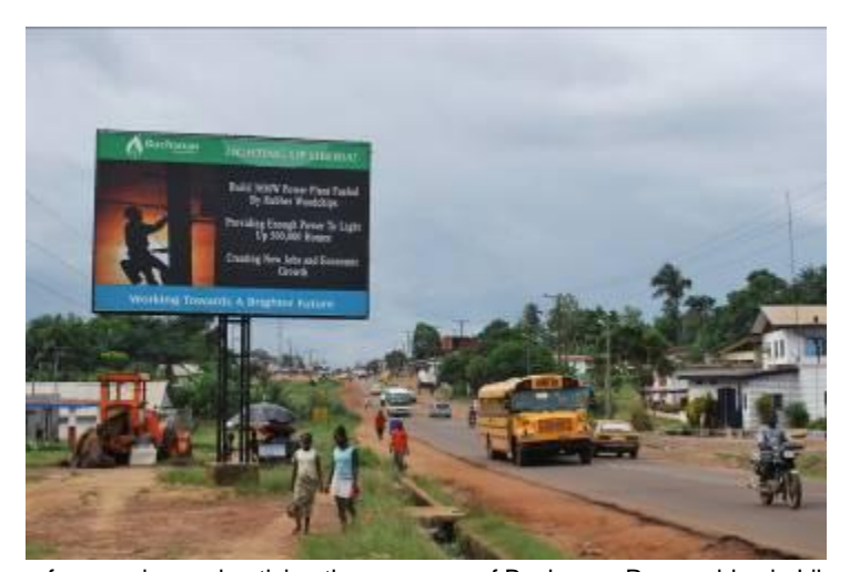
One of many signs advertising the presence of Buchanan Renewables in Liberia

The company's promises can also be inferred from the many billboards that line the streets of Monrovia and Buchanan, promising to "Light up Liberia". In documents found on its website, BR also uses slogans such as "Liberia, the world's first sustainable biomass driven economy" and "Let there be light in Africa."