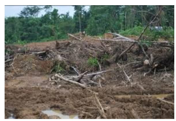
Branches and roots covered in dirt

is no evidence that BR's management was aware of these actions. However, it does exemplify ways in which such charcoal producers are facing increased hardships.