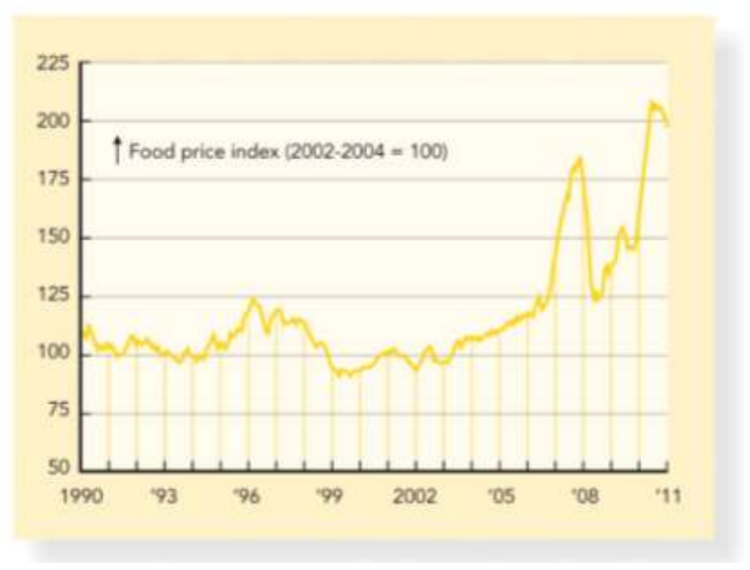
Figure 3. FAO index of world food prices

With financial investments in commodity derivatives markets on the rise again in 2010 and 2011 as well as prices of commodities, including those of food, the debate about the role of financial investments in driving prices up has returned.