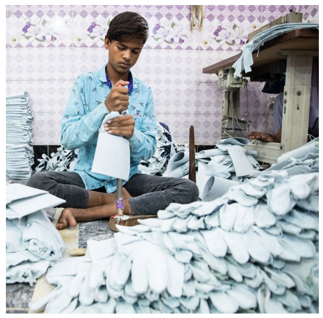
Young worker at an informal working place, Pakistan.