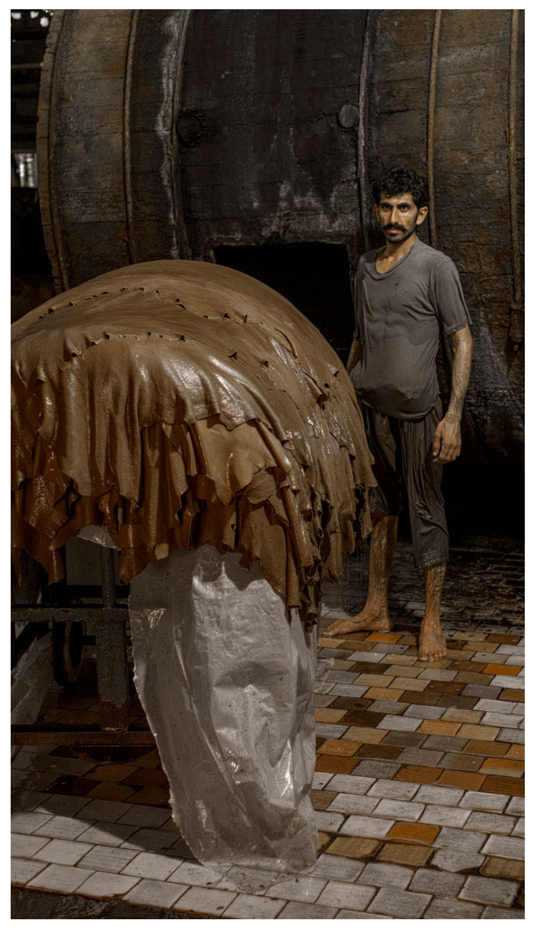
Worker in tannery, Pakistan.