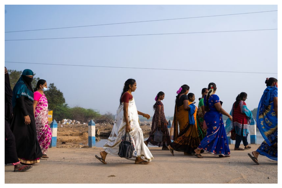
Women workers walking to the factory near Palar River, Ambur.

We accessed all websites cited in the paper between November 2021 and July 2022.