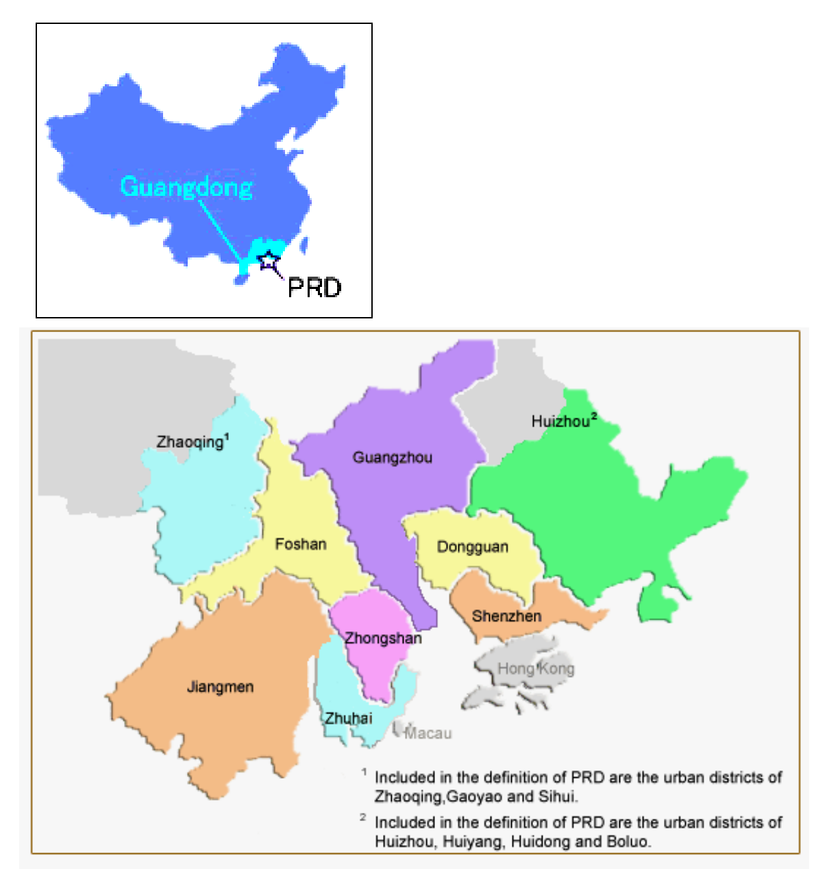
Dongguan, Zhongshan, and Jiangmen Cities – selected research field-sites