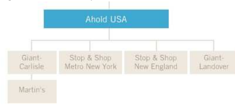
Figure 1: Ahold USA corporate structure

In February 2010 Ahold purchased 25 supermarkets in Richmond, Virginia in the US. These stores, which formerly belonged to Ukrop's supermarkets were merged into Ahold's Giant-Carlisle division and were added to the company's Martin's brand (see Figure 1).