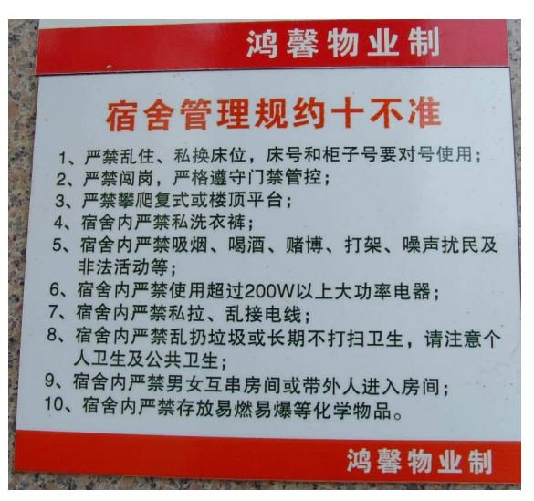
10 rules are listed at the entrance of the dormitory building.

Yu Kang is the permanent dormitory. It can house 140,000 people. Construction is still going on, and water and electricity suspension frequently occur. "Every two days there is water suspension, and every three days there is electricity suspension," a female worker said. She was sitting near the dormitory entrance with her friends because it was too hot to stay inside the room during an electricity suspension. Some workers complained they had to collect water from buckets on the ground floor due to water suspension. Water suspension can last for