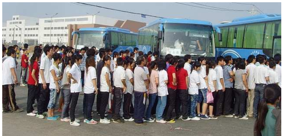
Night shift workers queue up for buses back to the dormitory. Sometimes, they have to wait under the hot sun or heavy rain.

There are limited company buses, and they have strict schedules. Sometimes when workers do not have overtime work, they have to wait an hour for the bus. On rainy days, the workers even have to queue up outdoors under heavy rain.