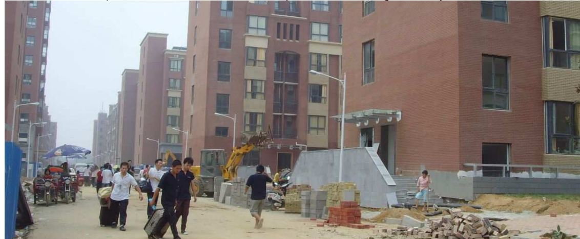
Yu Kang Dormitory is still under construction.