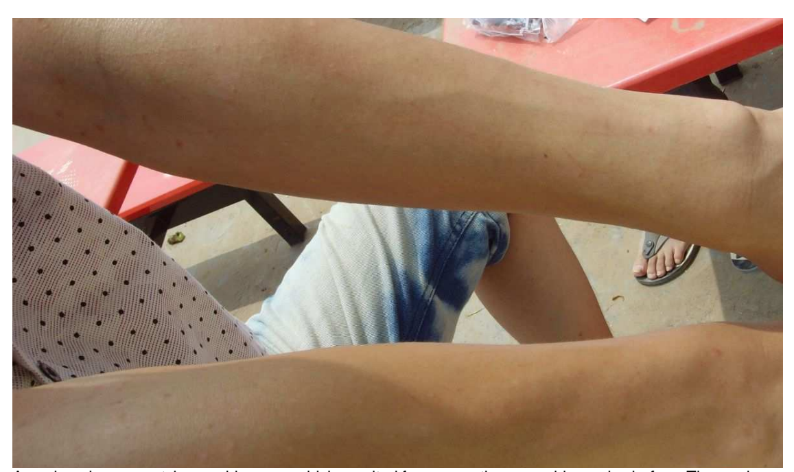
A worker shows scratches on his arms, which resulted from operating a machine a day before. The marks were more obvious when he left the factory, he said.

Another interviewee from the metal processing department shows his forearms, which are full of scratches. He plans to leave the factory soon due to the harsh conditions there.