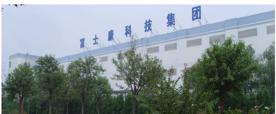
The temporary production site of Foxconn in the Economic Processing Zone, Zhengzhou.

Foxconn announced its plan for relocation to inland provinces after the spate of suicides in Shenzhen last year. Henan provincial government was the first province to attract such investment from Foxconn after the "13th jump" in 2010. Production commenced in August, 2010, only a month after the conclusion of the contract. The government has provided much assistance to Foxconn, including workers' recruitment and preparation of the production site. The Chinese media reported that about 100,000 vocational school students in Henan province were sent to Foxconn plants in Shenzhen for 3-month internships last year. Some student workers even disclosed that they were forced to work for Foxconn or face punishment by their schools. With the support from the government, the workforce in the factory has reached 52,500 within a year. And it was reported that the production capacity for the iPhone at the Foxconn factory in Zhengzhou soared to 100,000 per day.