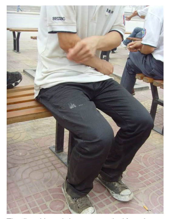
The dirty shirt and shoes are resulted from the "cutting fluid" in the metal processing department.

Besides unpaid overtime work, workers are required to attend unpaid work meetings. Most of the interviewees in Zhengzhou report that they have to arrive at the factory 20 minutes before the work shift begins. Meetings after work shifts last from 5 to 30 minutes.