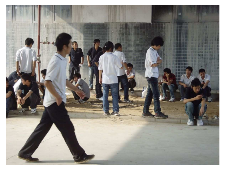
Workers do not have chairs to sit on in the open area of the campus. They can only sit or squat on the floor.

The production site in the Processing Zone is a temporary site that was offered by the local government a month after the contract was signed between the government and Foxconn. The permanent site for Foxconn is designated in the Airport Zone. While the construction work on the plants is still in progress, Foxconn has put some of the plants in operation. Basic facilities like canteens and food stores are not ready. Workers can hardly find a place to wash their hands after work. Dust flies around on the construction site and there is flooding during rainy days.