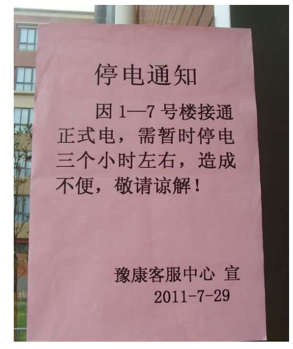
Electricity suspension announcement in Yu Kang Dormitory. "There will be a 3-hour electricity suspension in Blocks 1-7".

half a day, so they have to go to a public bathroom to take baths.