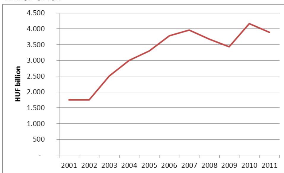
Figure 2: Gross production of computers, electronics and optical products in Hungary, 2001-2011, in HUF billion

Source: Hungarian Central Statistical Office 26