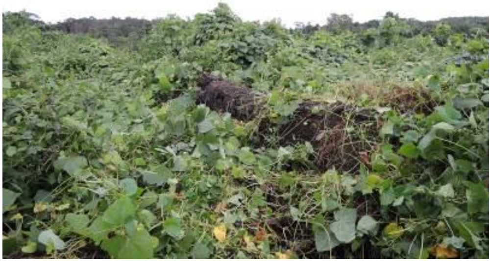
Trees felled by BR have never been removed from Marthalyne Gongar's farm.

In all of these cases, it is probable that the farms will become completely overgrown and inaccessible.