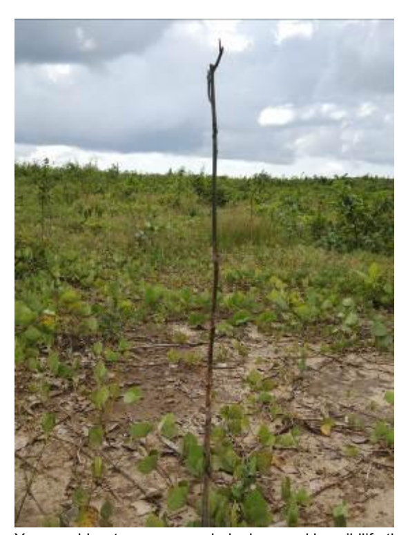
Young rubber trees are regularly damaged by wildlife that eats the leaves and retards the growth of the trees. Photo taken at the Nathan Horace farm.