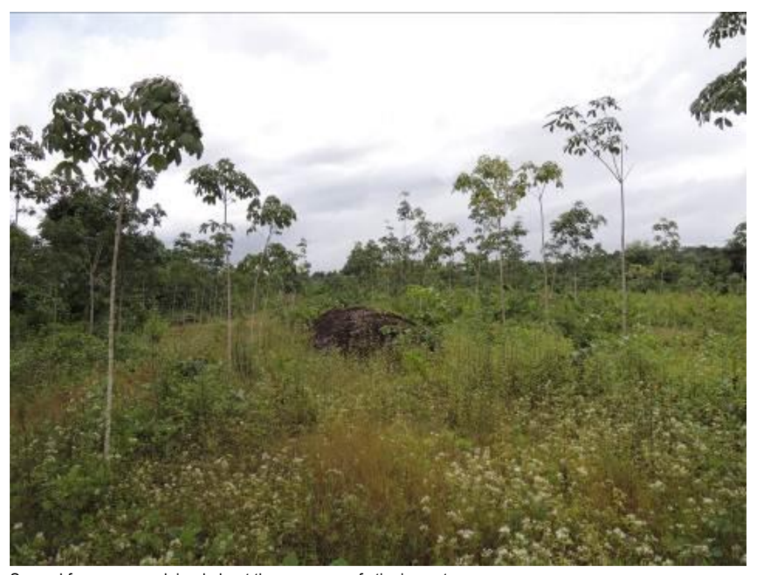
Several farmers complained about the presence of stinging ants, attracted by the piles of old woodchips placed on the farms by BR in 2011. Photo taken at the Barchue farm.

It should also be noted that some of the farmers were still complaining about the presence of these chips, as the presence of stinging ants was still creating difficulties, while others believed that these chips hampered the growth of the rubber trees. The scope of the present research did not allow for further analysis of the exact effects of these woodchips on water quality or on the presence of ants.