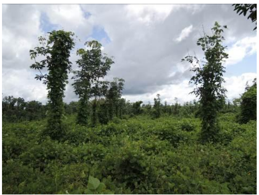
If not properly maintained, the cover grass will creep up the young rubber trees, and ventually kill them. Photo taken at the Richard Wheghar farm.