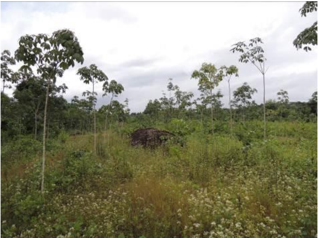
Several farmers complained about the presence of stinging ants, attracted by the piles of old woodchips placed on the farms by BR in 2011. Photo taken at the Barchue farm.

It should also be noted that some of the farmers were still complaining about the presence of these chips, as the presence of stinging ants was still creating difficulties, while others believed that these chips hampered the growth of the rubber trees. The scope of the present research did not allow for further analysis of the exact effects of these woodchips on water quality or on the presence of ants.