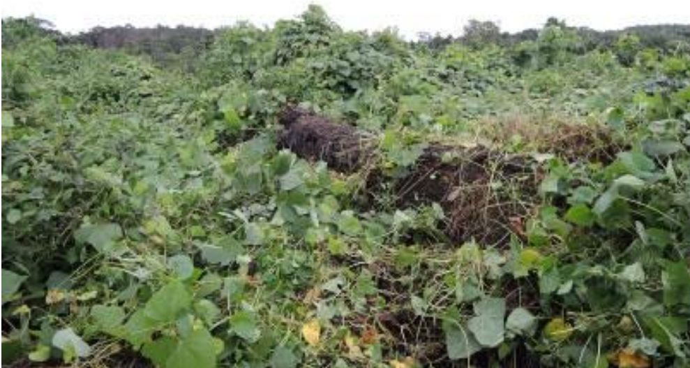
Trees felled by BR have never been removed from Marthalyne Gongar's farm.

In all of these cases, it is probable that the farms will become completely overgrown and inaccessible.