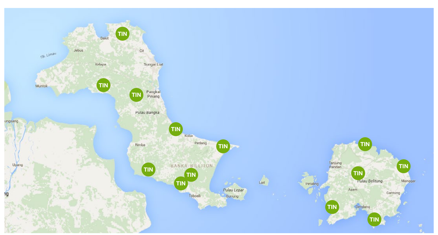
Map of land tin mining on Banka and Malay (offshore mining not included)

In tin mining, basic labour rights are neglected, especially by informal miners. Child labour is used, although in most cases only when tin prices are very high and/or by children after school. The United Nations Guiding Principles on Business and Human Rights (UNGPs) and the Organisation for Economic Development and Cooperation's Guidelines for Multinational Enterprises (OECD Guidelines) set clear standards for business enterprises to respect human rights, conduct human rights due diligence and implement measures to prevent, address and redress any human rights violations.