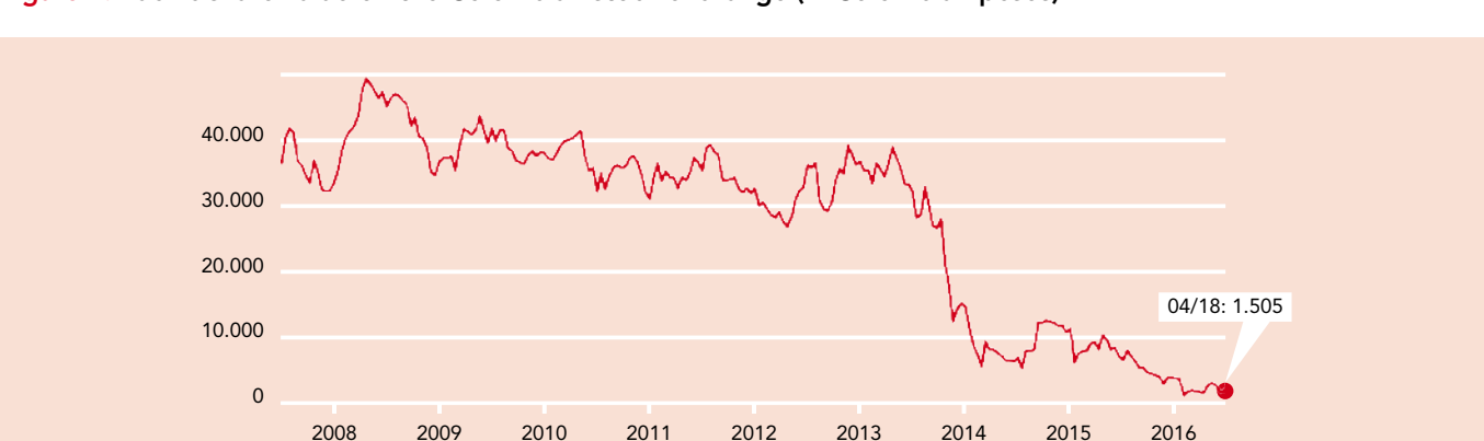
Figure 2. Pacific share value on the Colombian stock exchange (in Colombian pesos)

The demobilisation of the AUC in 2006 led to the emergence of new groups known as Criminal Gangs or Organized Armed Groups (GAO). They are currently fighting over the revenue from drug trafficking and are said to be responsible for human rights violations against local people in the region, as well as being involved in extortion, the pillaging of land and facilitating the establishment of new economic projects, activities that have all been amply reported by the Office of the Human Rights Defender.