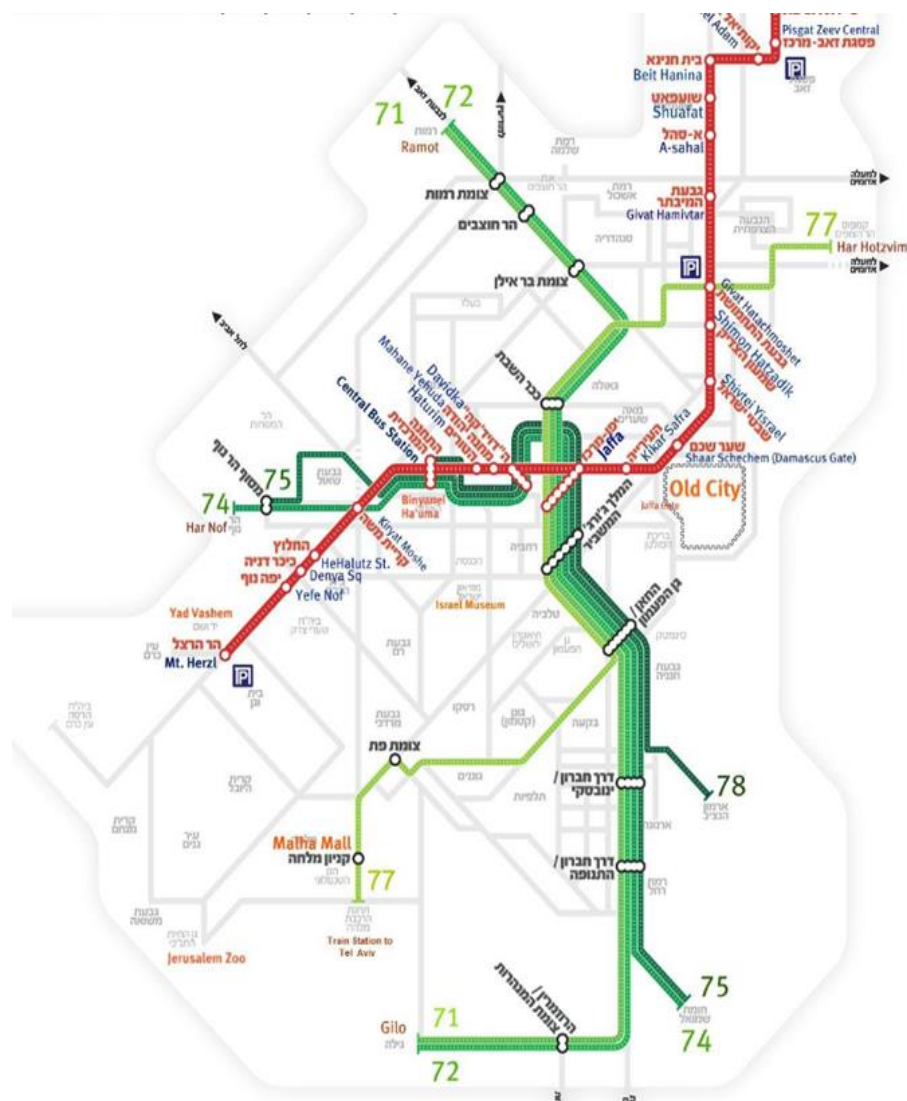
Map 1: Jerusalem Light Rail Map 1 49 – Official Route