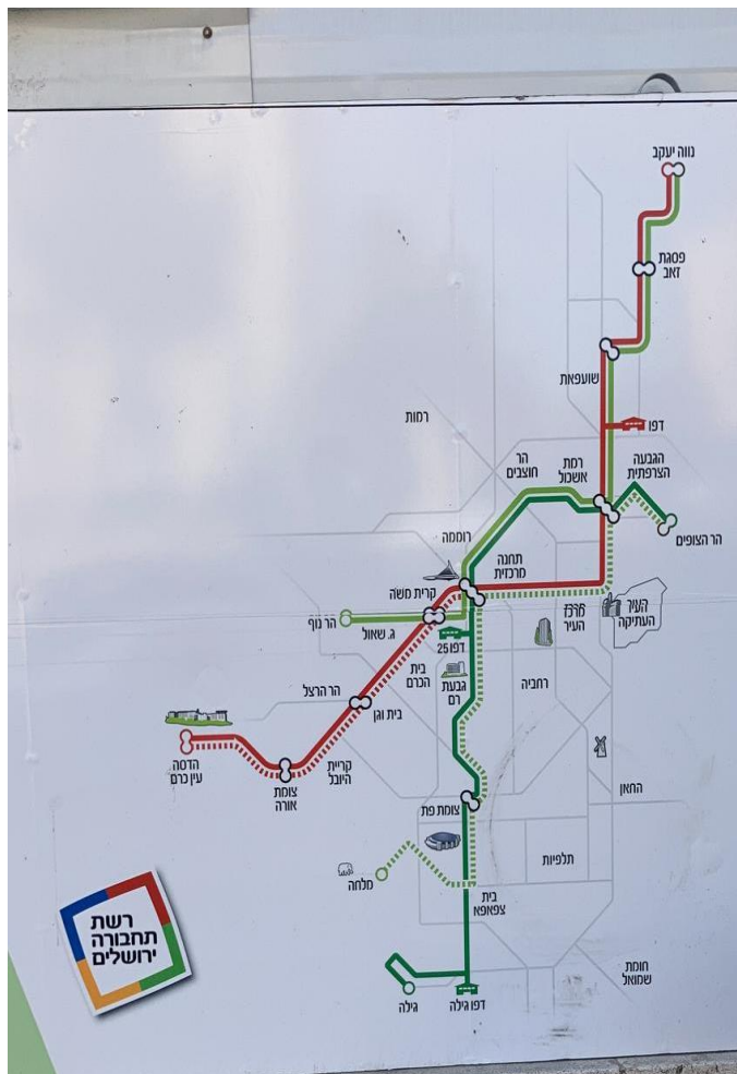
Image 1 & 2: Banners placed near the construction site of the JLR project near the French Hill in Jerusalem. The first image shows the different stops of the three lines, including in illegal settlements in occupied East Jerusalem. Photos taken on 17 November 2020.